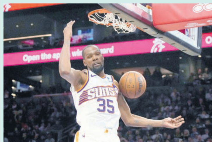
Phoenix Suns forward Kevin Durant dunks against the Philadelphia 76ers during the second half of an NBA basketball game Wednesday, March 20, 2024, in Phoenix.